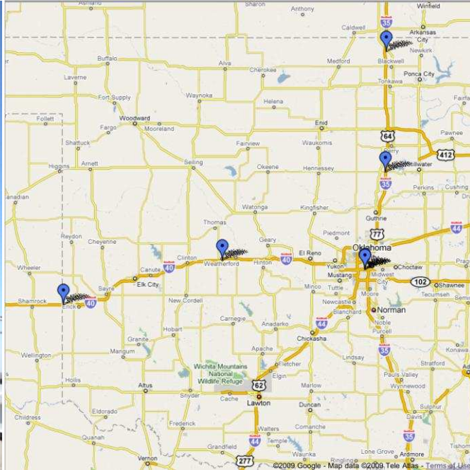
Figure 3: Location of the 6 deployed RWIS stations

2 shows the deployment of an RWIS station near Weatherford, OK being deployed by Vaisala, one of the two vendors of RWIS stations ODOT has currently deployed. This deployment was performed with consultation and participation of the OU ITS Lab Manager. We are further assisting ODOT in the evaluation of the deployed RWIS stations, manufactured from various vendors. Figure 3 shows the locations of the 6 RWIS sites deployed in Oklahoma at the end of Year 1 of this project. Note, two RWIS sites are co-located in Oklahoma City. Two different vendors have been contracted thus far to install RWIS stations along Oklahoma Highways, Vaisala and Surface Systems (SSI). By working with both of these vendors, we have established mechanisms to automatically retrieve RWIS sensor data from stations manufactured by Vaisala and are still working on retrieving data from those manufactured by SSI. Note that stations from each vendor feature different measurement capabilities, as well as how they are presented to us; Vaisala provides us XML data using the National Transportation Communications for ITS Protocol (NTCIP) [4]. A sample of this data is shown in Figure 4. SSI can only provide us with a website from which the data must be extracted and parsed. We have developed a MySQL database for the storage and retrieval of this sensor data.