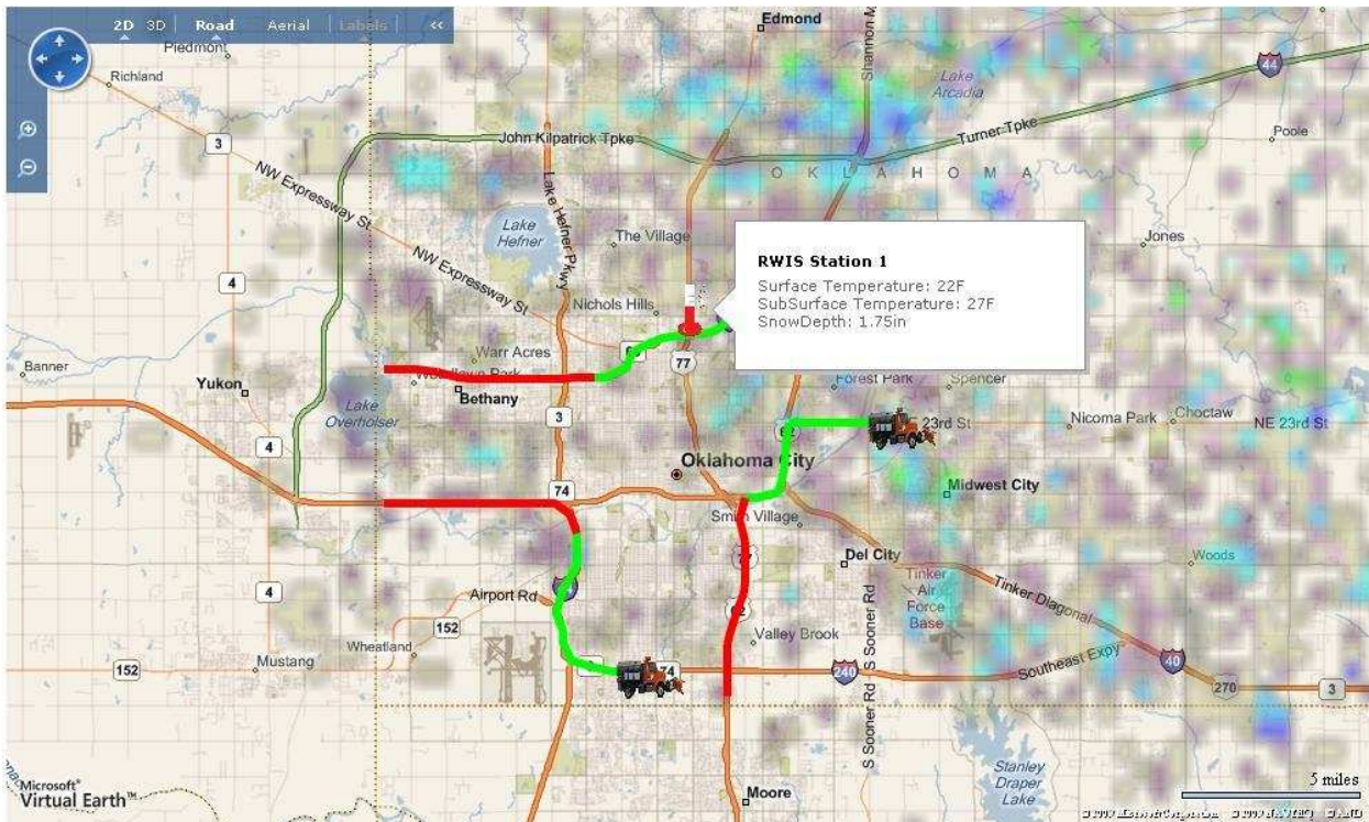
Figure 1: The Inclement Weather Console

This console merges data from Automatic Vehicle Location (AVL) instrumentation within Oklahoma Department of Transportation vehicles, weather sensor data from a network of Road Weather Information System (RWIS) stations currently being deployed and other real-time weather data including data from the National Oceanographic and Atmospheric Administration (NOAA) and the Oklahoma Climatological Survey into a single visualization framework. During the beta testing of this console it is available only to ODOT personnel. Additionally, during this project, we have developed the capability to display non-sensitive portions of this data via ODOT’s Advanced Traveler Information System (ATIS) website.