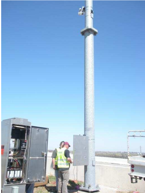
Figure 2: RWIS Deployment in Weatherford, OK