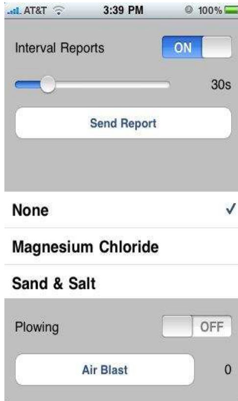
Figure 7: iPhone application used to simulate instrumented vehicles.

Instruments for these various measurements are, by necessity, custom to the vehicle being instrumented. The vehicles that are desirable to track during inclement weather consist of different types of vehicles (including plows and spreader trucks) with a variety of makes of each type. Additionally, many features will be missing from particular vehicles. For example, some trucks may not feature a movable plow, and some spreader vehicles always apply the same mix of salts and sand at the same rate.